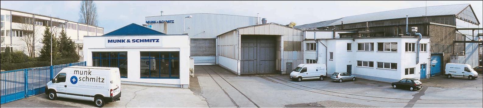
View of the Munk + Schmitz production and development facilities

Founded in 1890 Munk + Schmitz originally built apparatus and tanks for the chemical industry. Later on, the activities focussed on the production of large tanks for the beverage industry.