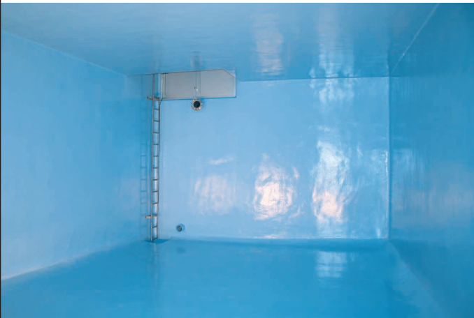
Lined concrete tank