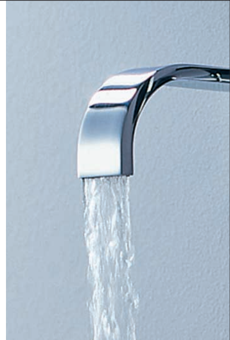
Fresh tap water

When regularly inspected and repaired Munkadur® linings enjoy a long life and will last for decades.